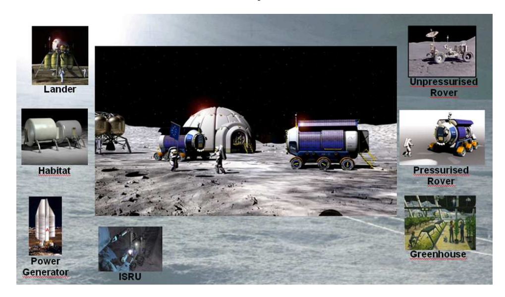
Fig. 3. Moon Surface Infrastructure (Thales Alenia Space - Italia)

of transport systems and the lack of a common transportation policy between partners, which could jeopardize the optimal utilization of space infrastructures in LEO.