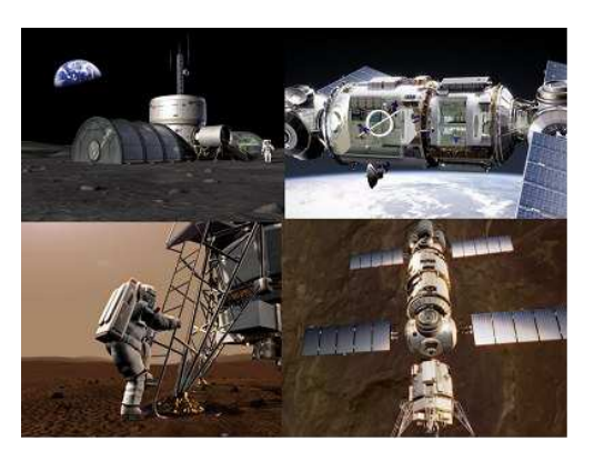
Fig. 1. From ISS to Moon and Mars

The operation and growth of the ISS could take into account possible extended utilization of individual modules as prototype vehicles to conduct demonstrations of outer exploration missions.